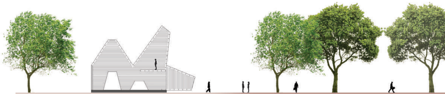
presek kroz stambenu jedinicu