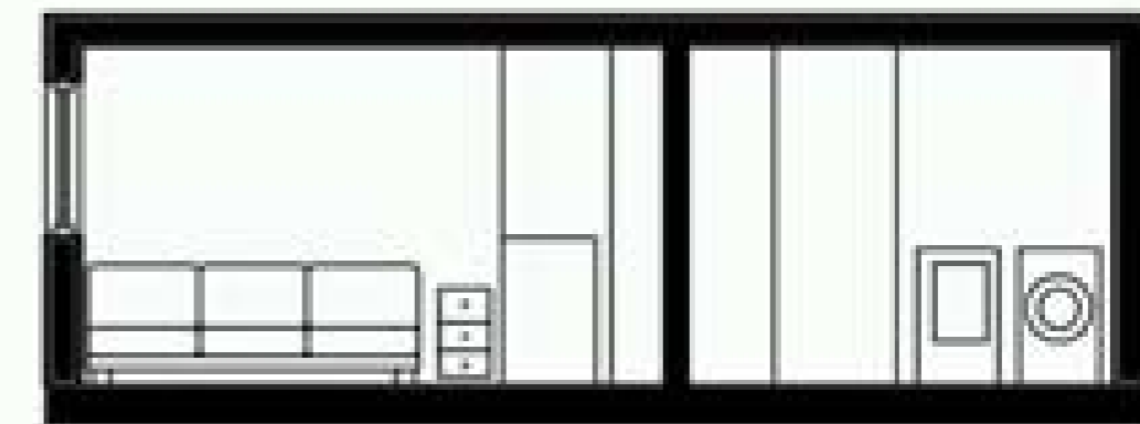
presek stana r=1:50